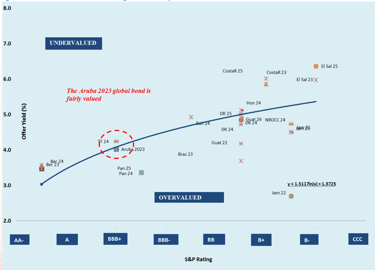
Figure 1: Relative Value of Asset in the Mid-range of the LATAM yield Curve